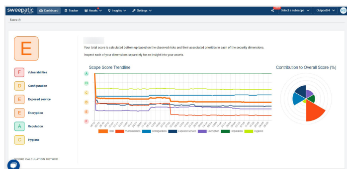
Attack surface scoring